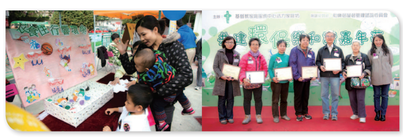
中心藉著環保攤位遊戲,向居民發放環保訊息。 'Green Life' game booth was held to convey environmental protection messages to the residents.

As a district-based integrated family service centre, Family Energizer (Integrated Family Service) understands the importance of community network in rendering service to local residents extensively and effectively. Last year, Family Energizer (Integrated Family Service) had good collaboration with local organisations, schools, local leaders and government departments in case referrals and community activities. With the support from Tsui Ping (South) Estate Management Advisory Committee and Wo Lok Estate Management Advisory Committee, Family Energizer (Integrated Family Service) mobilised volunteers to visit families in the community, which aimed at helping the 'hidden families' out as early as possible. Moreover, large-scale programmes were launched to convey environmental protection and harmonious family messages to the residents.