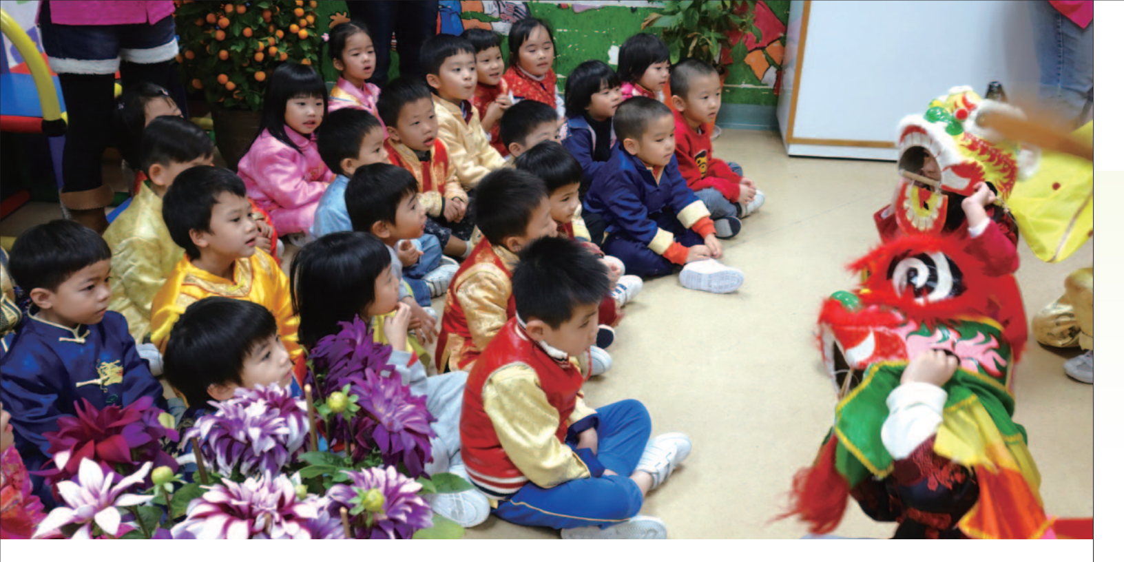
新春團拜活動 Lunar New Year activity