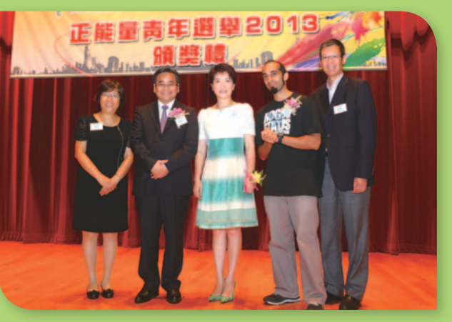
「正能量青年選舉 2013」主禮嘉賓合照。 'Positive Youth Award 2013' - Group photos of the officating quests.

'PATHS to Adulthood - a Jockey Club Youth Enhancement Scheme for Community' provided a variety of activities for students in the first lesson.