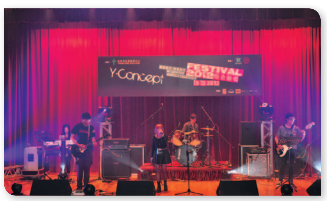
「Y-Concept 青年創作人計劃」 一參加者於 Y-Concept Mini Stage 發佈他們創作的新歌曲。

'Y-Concept Young Creator Project' - youngsters released their own songs in Y-Concept Mini Stage.