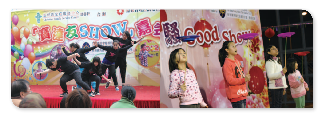
寶達「動感 90 後」 Youngsters in Motion - Potat Community Project

Our Jockey Club Youth Leap (Integrated Children & Youth Services Centre), School Social Work Service and YOU CAN - Potential Exploration Unit have adopted 'community-based', 'school-based' and 'project-based' as their respective service position. Jockey Club Youth Leap continued to build up cooperated network with local stakeholders so as to approach wide range of young people. Meanwhile, the School Social Work Service continued developing specific counselling programmes to address students' needs. And, YOU CAN - Potential Exploration Unit did make every endeavour to create art and sports / adventure-based projects with an aim of energising our youth work intervention. All these strategies were echoing with the 2 main work focuses of the youth service continuum, 'promoting positive youth development' and 'encouraging young people to participate in social affairs'.